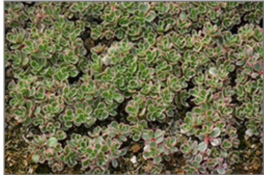
Tricolor Stonecrop flowers

Tricolor Stonecrop will grow to be only 4 inches tall at maturity, with a spread of 18 inches. When grown in masses or used as a bedding plant, individual plants should be spaced approximately 15 inches apart. Its foliage tends to remain low and dense right to the ground. It grows at a fast rate, and under ideal conditions can be expected to live for approximately 10 years. As an herbaceous perennial, this plant will usually die back to the crown each winter, and will regrow from the base each spring. Be careful not to disturb the crown in late winter when it may not be readily seen!