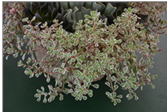
Tricolor Stonecrop