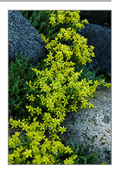
Six Row Stonecrop flowers