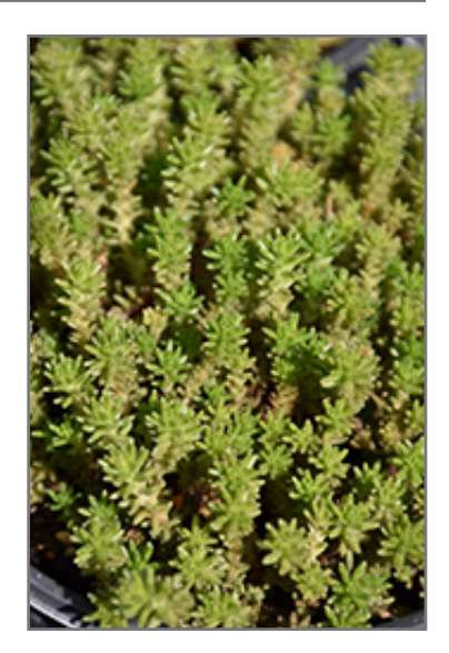
Six Row Stonecrop foliage

This plant does best in full sun to partial shade. It prefers dry to average moisture levels with very well-drained soil, and will often die in standing water. It is considered to be drought-tolerant, and thus makes an ideal choice for a low-water garden or xeriscape application. It is not particular as to soil pH, but grows best in poor soils, and is able to handle environmental salt. It is highly tolerant of urban pollution and will even thrive in inner city environments. This species is not originally from North America. It can be propagated by division.