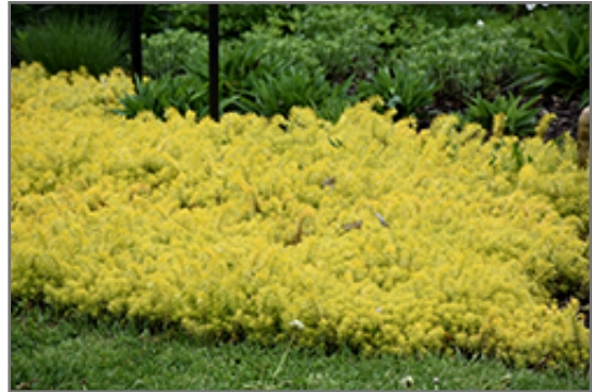
Angelina Stonecrop

This plant does best in full sun to partial shade. It prefers dry to average moisture levels with very well-drained soil, and will often die in standing water. It is considered to be drought-tolerant, and thus makes an ideal choice for a low-water garden or xeriscape application. It is not particular as to soil pH, but grows best in poor soils, and is able to handle environmental salt. It is highly tolerant of urban pollution and will even thrive in inner city environments. This is a selected variety of a species not originally from North America. It can be propagated by division; however, as a cultivated variety, be aware that it may be subject to certain restrictions or prohibitions on propagation.