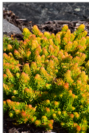
Angelina Stonecrop foliage