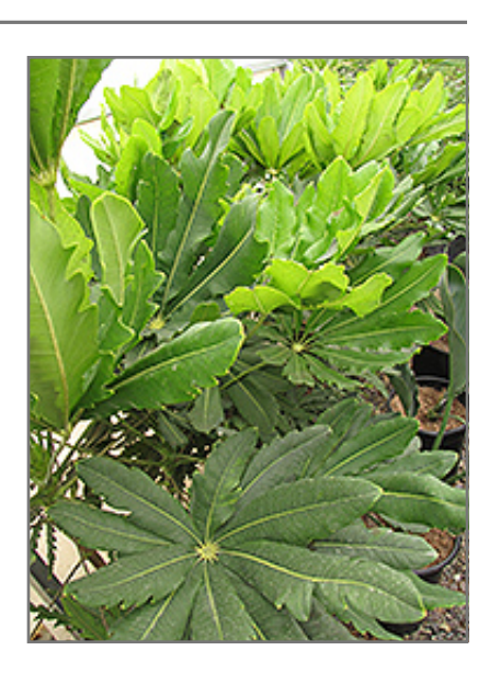
False Aralia foliage

There are many factors that will affect the ultimate height, spread and overall performance of a plant when grown indoors; among them, the size of the pot it's growing in, the amount of light it receives, watering frequency, the pruning regimen and repotting schedule. Use the information described here as a guideline only; individual performance can and will vary. Please contact the store to speak with one of our experts if you are interested in further details concerning recommendations on pot size, watering, pruning, repotting, etc.