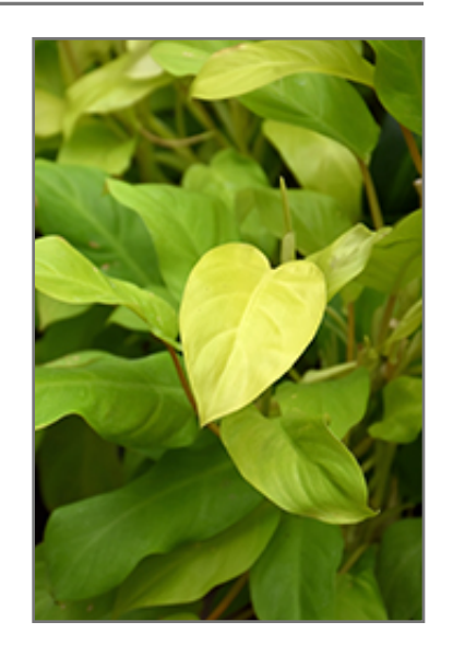
Lemon Lime Philodendron foliage

There are many factors that will affect the ultimate height, spread and overall performance of a plant when grown indoors; among them, the size of the pot it's growing in, the amount of light it receives, watering frequency, the pruning regimen and repotting schedule. Use the information described here as a guideline only; individual performance can and will vary. Please contact the store to speak with one of our experts if you are interested in further details concerning recommendations on pot size, watering, pruning, repotting, etc.