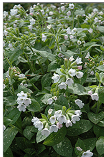
Sissinghurst White Lungwort flowers