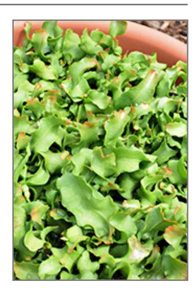
Orchid Catcus foliage

Orchid Catcus is a succulent evergreen plant. It is an atypical member of the cactus family known as an 'epiphyte' or 'air plant', which means that it doesn't necessarily require a growing medium for its roots. Like all other cacti, it doesn't actually have leaves, but rather modified succulent stems that comprise the bulk of the plant. This particular variety of cactus is valued for its characteristically trailing and weeping form on a plant consisting of long and flattened smooth lime green segmented stems that typically form 'branches' which will grow outwards and even spill over the edges of containers. This plant features showy lightly-scented white daisy flowers along the stems from mid spring to mid summer, which emerge from distinctive pink flower buds.