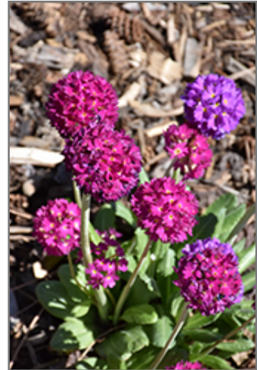
Drumstick Primrose flowers