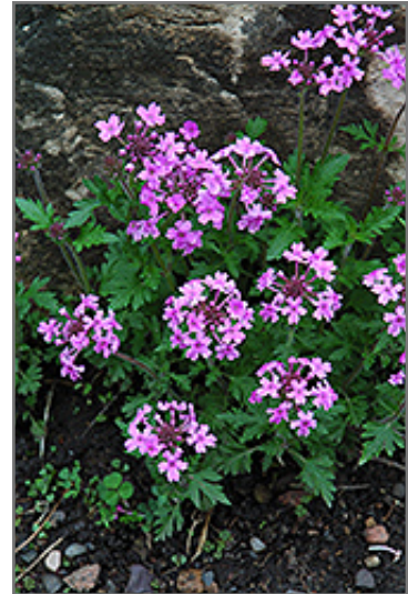
Drumstick Primrose in bloom

This plant does best in partial shade to shade. It does best in average to evenly moist conditions, but will not tolerate standing water. It is not particular as to soil type or pH. It is somewhat tolerant of urban pollution, and will benefit from being planted in a relatively sheltered location. Consider covering it with a thick layer of mulch in winter to protect it in exposed locations or colder microclimates. This species is not originally from North America.