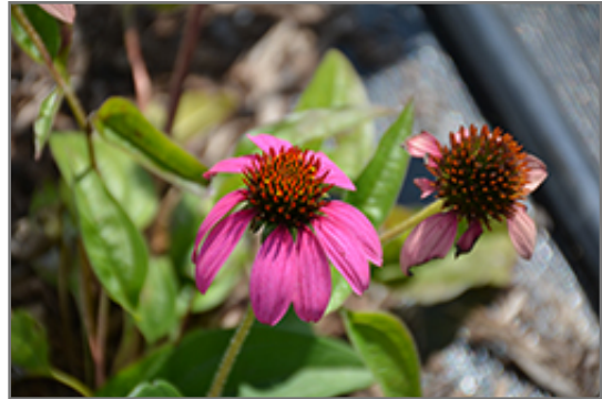
Amazing Dream Coneflower flowers