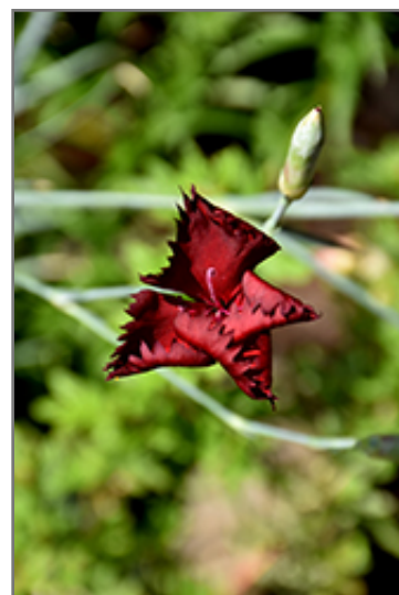
Grenadin King Of The Blacks Carnation flowers