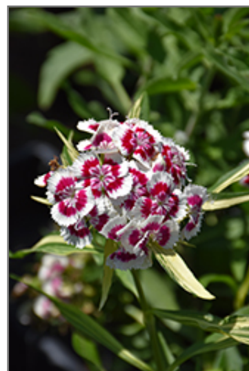
Barbarini Red Picotee Sweet William flowers

Barbarini Red Picotee Sweet William is recommended for the following landscape applications;