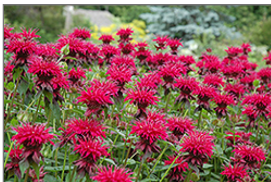
Raspberry Wine Beebalm flowers