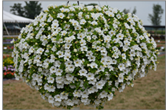
MiniFamous Uno White Calibrachoa in bloom

MiniFamous Uno White Calibrachoa will grow to be about 10 inches tall at maturity, with a spread of 14 inches. When grown in masses or used as a bedding plant, individual plants should be spaced approximately 10 inches apart. Its foliage tends to remain low and dense right to the ground. This fast-growing annual will normally live for one full growing season, needing replacement the following year.