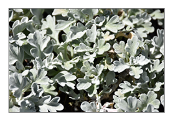
Boughton Silver Artemisia foliage