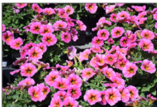
SuperCal Premium Sunray Pink Petchoa in bloom