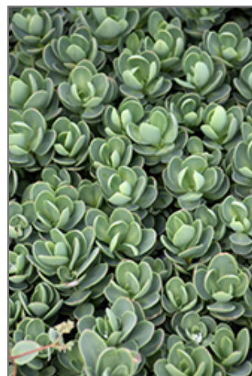
Pink Mongolian Stonecrop foliage

Pink Mongolian Stonecrop is a fine choice for the garden, but it is also a good selection for planting in outdoor pots and containers. It is often used as a 'filler' in the 'spiller-thriller-filler' container combination, providing a mass of flowers and foliage against which the thriller plants stand out. Note that when growing plants in outdoor containers and baskets, they may require more frequent waterings than they would in the yard or garden. Be aware that in our climate, most plants cannot be expected to survive the winter if left in containers outdoors, and this plant is no exception. Contact our experts for more information on how to protect it over the winter months.