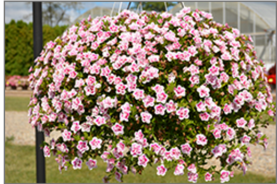
MiniFamous Uno Double PinkTastic Calibrachoa in bloom

MiniFamous Uno Double PinkTastic Calibrachoa is a fine choice for the garden, but it is also a good selection for planting in outdoor containers and hanging baskets. Because of its trailing habit of growth, it is ideally suited for use as a 'spiller' in the 'spiller-thriller-filler' container combination; plant it near the edges where it can spill gracefully over the pot. Note that when growing plants in outdoor containers and baskets, they may require more frequent waterings than they would in the yard or garden.