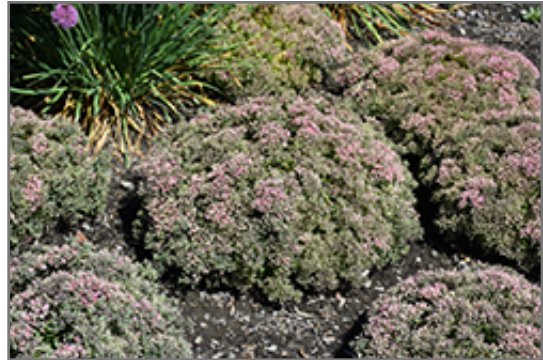
Rock 'N Round Pride and Joy Stonecrop in bloom

Rock 'N Round Pride and Joy Stonecrop will grow to be about 10 inches tall at maturity, with a spread of 20 inches. When grown in masses or used as a bedding plant, individual plants should be spaced approximately 16 inches apart. Its foliage tends to remain low and dense right to the ground. It grows at a fast rate, and under ideal conditions can be expected to live for approximately 15 years. As an herbaceous perennial, this plant will usually die back to the crown each winter, and will regrow from the base each spring. Be careful not to disturb the crown in late winter when it may not be readily seen!