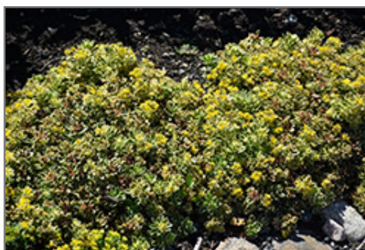
Rock 'N Low Boogie Woogie Stonecrop in bloom