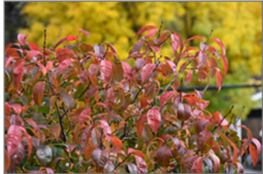
Muckle Plum in fall

This shrub should only be grown in full sunlight. It does best in average to evenly moist conditions, but will not tolerate standing water. It is not particular as to soil type or pH. It is highly tolerant of urban pollution and will even thrive in inner city environments. This particular variety is an interspecific hybrid.