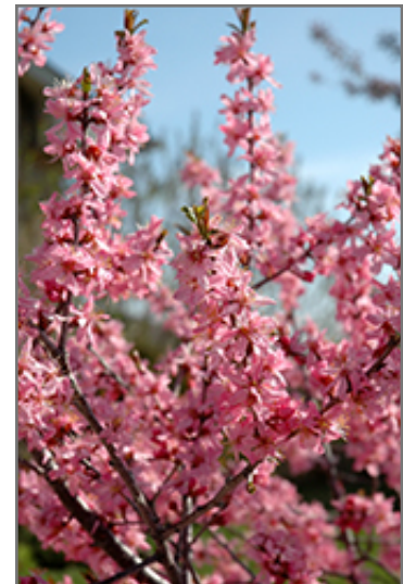
Muckle Plum flowers