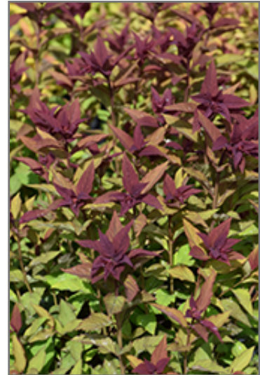
Double Play Doozie Spirea foliage

This shrub should only be grown in full sunlight. It prefers to grow in average to moist conditions, and shouldn't be allowed to dry out. It is not particular as to soil type or pH. It is highly tolerant of urban pollution and will even thrive in inner city environments. This particular variety is an interspecific hybrid.