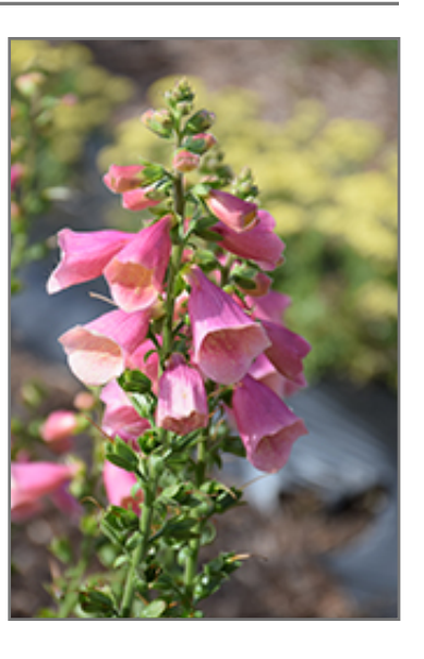
Arctic Fox Rose Foxglove flowers