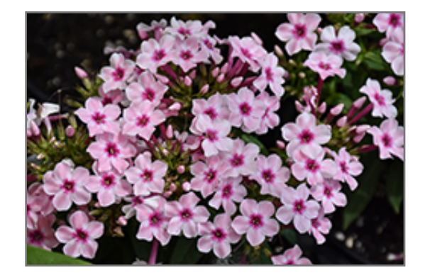
Early Pink Dark Eye Garden Phlox flowers