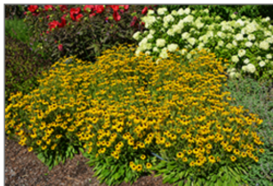
American Gold Rush Coneflower in bloom