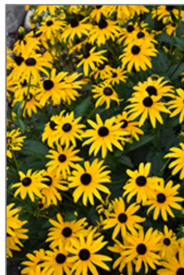
American Gold Rush Coneflower flowers

American Gold Rush Coneflower is recommended for the following landscape applications;