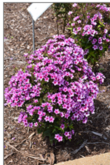
Early Purple Pink Eye Garden Phlox in bloom