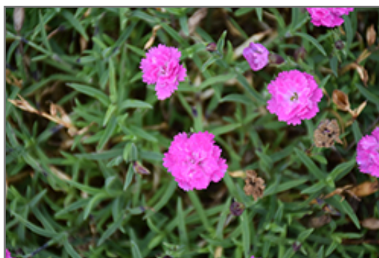
Mountain Frost Pink PomPom Pinks flowers

Mountain Frost Pink PomPom Pinks is recommended for the following landscape applications;