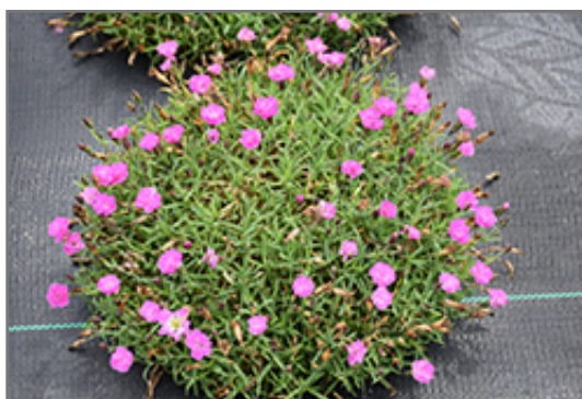
Mountain Frost Pink PomPom Pinks in bloom