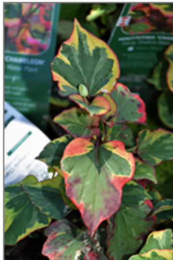
Variegated Chameleon Plant foliage