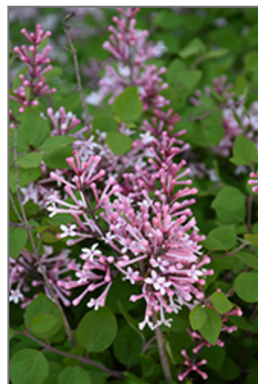
Bloomerang Dwarf Pink Lilac flowers