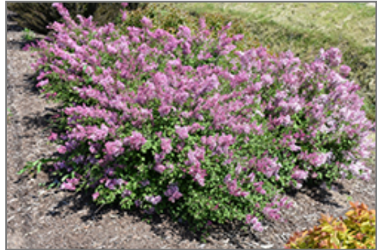
Bloomerang Dwarf Pink Lilac in bloom

This shrub should only be grown in full sunlight. It does best in average to evenly moist conditions, but will not tolerate standing water. It is not particular as to soil type or pH. It is highly tolerant of urban pollution and will even thrive in inner city environments. This particular variety is an interspecific hybrid.