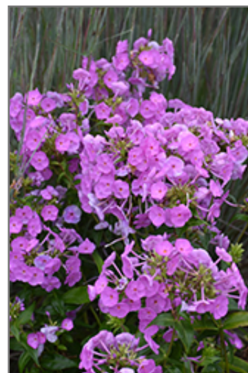
Fashionably Early Flamingo Garden Phlox flowers

Fashionably Early Flamingo Garden Phlox is recommended for the following landscape applications;