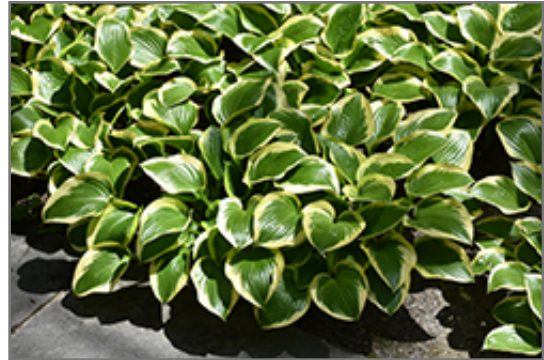
Queen Josephine Hosta