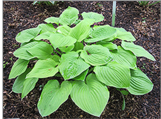
August Moon Hosta