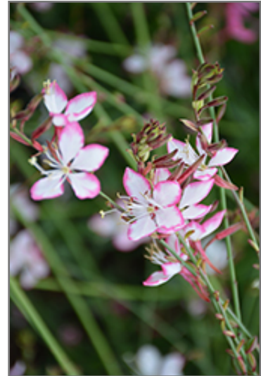
Rosy Jane Gaura flowers