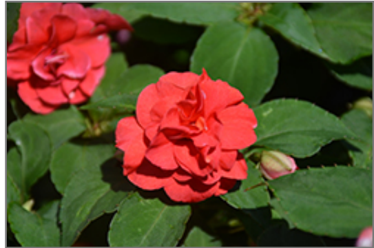
Rockapulco Red Impatiens flowers