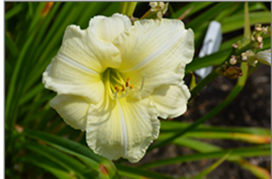
Joan Senior Daylily flowers