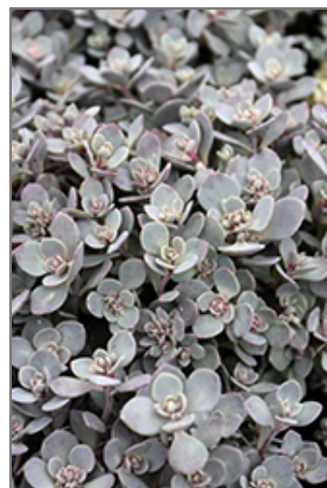
SunSparkler Blue Elf Sedoro foliage

SunSparkler Blue Elf Sedoro will grow to be only 4 inches tall at maturity extending to 6 inches tall with the flowers, with a spread of 16 inches. When grown in masses or used as a bedding plant, individual plants should be spaced approximately 15 inches apart. Its foliage tends to remain low and dense right to the ground. It grows at a medium rate, and under ideal conditions can be expected to live for approximately 15 years. As an herbaceous perennial, this plant will usually die back to the crown each winter, and will regrow from the base each spring. Be careful not to disturb the crown in late winter when it may not be readily seen!