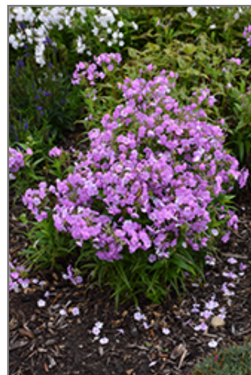
Fashionably Early Princess Garden Phlox in bloom