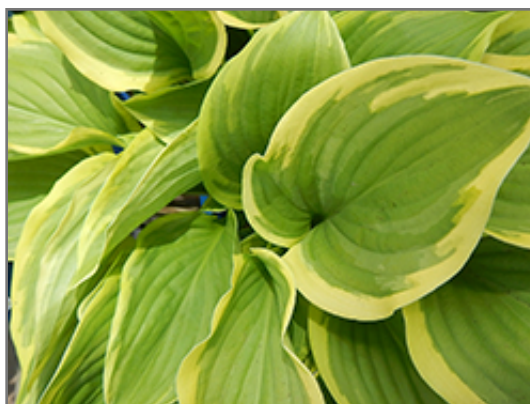
Fragrant Dream Hosta foliage

Fragrant Dream Hosta is recommended for the following landscape applications;