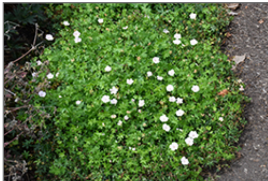
Pink Summer Cranesbill in bloom