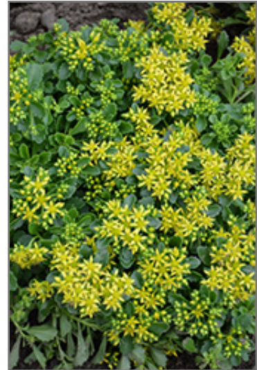
Little Miss Sunshine Stonecrop flowers

Little Miss Sunshine Stonecrop is recommended for the following landscape applications;