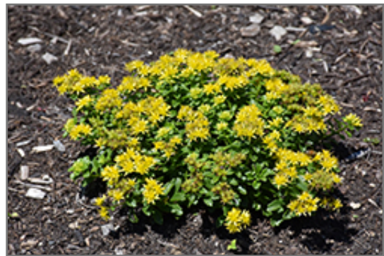
Little Miss Sunshine Stonecrop in bloom