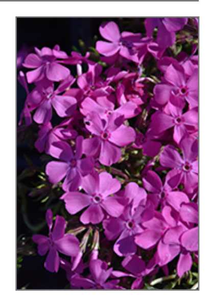
McDaniel's Cushion Moss Phlox flowers