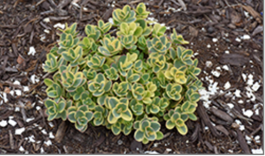
Lime Twister Stonecrop

This plant does best in full sun to partial shade. It is very adaptable to both dry and moist growing conditions, but will not tolerate any standing water. It is considered to be drought-tolerant, and thus makes an ideal choice for a low-water garden or xeriscape application. It is not particular as to soil pH, but grows best in poor soils, and is able to handle environmental salt. It is highly tolerant of urban pollution and will even thrive in inner city environments. This particular variety is an interspecific hybrid. It can be propagated by division; however, as a cultivated variety, be aware that it may be subject to certain restrictions or prohibitions on propagation.