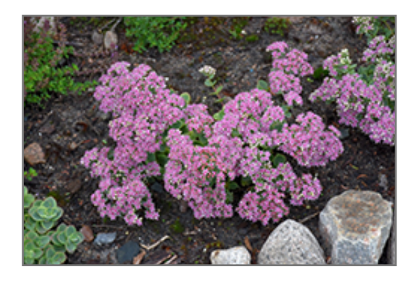
Lime Twister Stonecrop in bloom