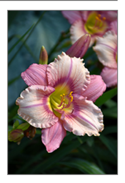
Happy Ever Appster Stephanie Returns Daylily flowers