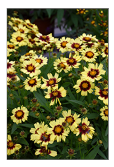
UpTick Yellow and Red Tickseed flowers