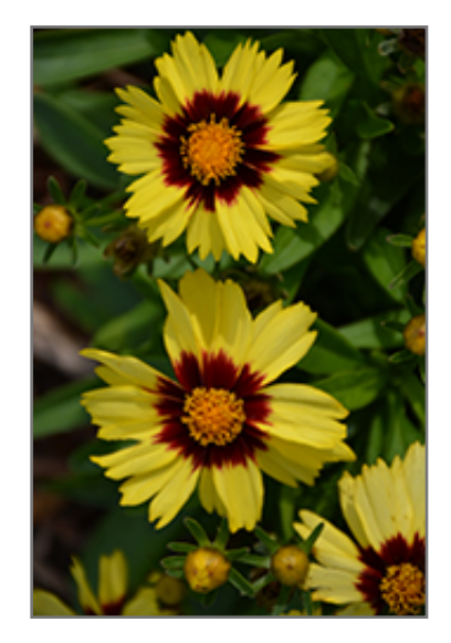
UpTick Yellow and Red Tickseed flowers