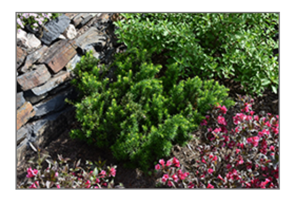
Morden Japanese Yew