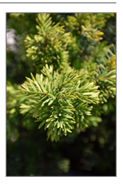
Morden Japanese Yew foliage

This shrub performs well in both full sun and full shade. However, you may want to keep it away from hot, dry locations that receive direct afternoon sun or which get reflected sunlight, such as against the south side of a white wall. It does best in average to evenly moist conditions, but will not tolerate standing water. It is not particular as to soil type or pH. It is highly tolerant of urban pollution and will even thrive in inner city environments, and will benefit from being planted in a relatively sheltered location. Consider applying a thick mulch around the root zone in winter to protect it in exposed locations or colder microclimates. This is a selected variety of a species not originally from North America, and parts of it are known to be toxic to humans and animals, so care should be exercised in planting it around children and pets.