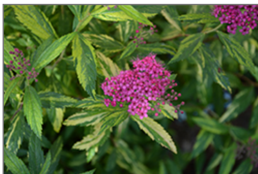
Double Play Painted Lady Spirea flowers

Double Play Painted Lady Spirea is recommended for the following landscape applications;