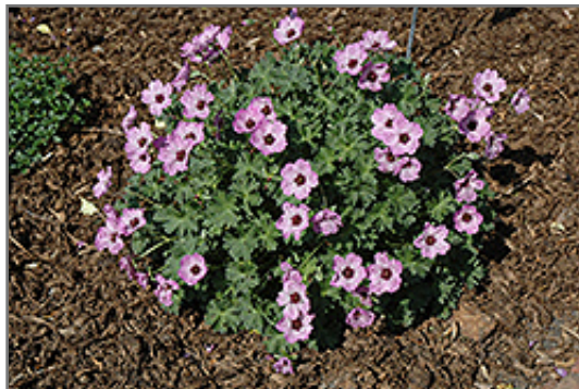
Ballerina Cranesbill flowers