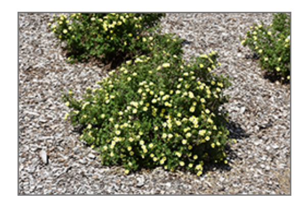
Lemon Meringue Potentilla in bloom