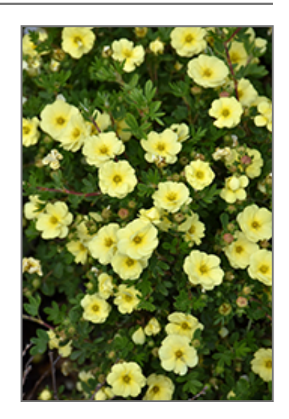
Lemon Meringue Potentilla flowers