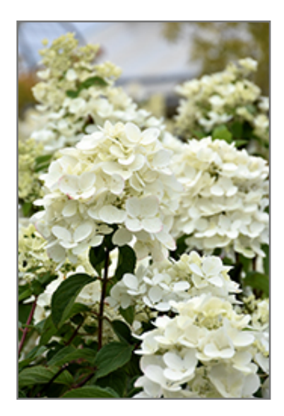
Diamond Rouge Hydrangea flowers