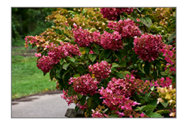
Diamond Rouge Hydrangea flowers