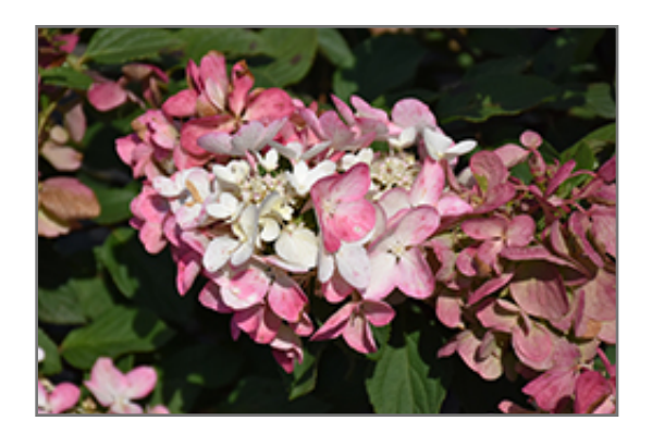
Diamond Rouge Hydrangea flowers