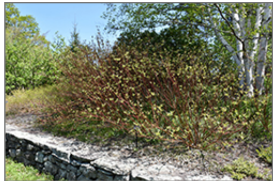
Bailey's Red Twig Dogwood in spring