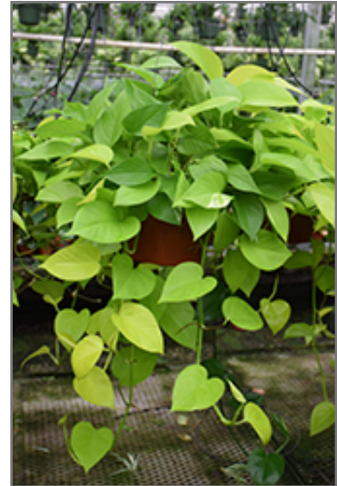
Neon Pothos in full

When grown indoors, Neon Pothos can be expected to grow to be about 5 feet tall at maturity, with a spread of 24 inches. It grows at a fast rate, and under ideal conditions can be expected to live for approximately 10 years. This houseplant performs well in both bright or indirect sunlight and strong artificial light, and can therefore be situated in almost any well-lit room or location. It does best in average to evenly moist soil, but will not tolerate standing water. The surface of the soil shouldn't be allowed to dry out completely, and so you should expect to water this plant once and possibly even twice each week. Be aware that your particular watering schedule may vary depending on its location in the room, the pot size, plant size and other conditions; if in doubt, ask one of our experts in the store for advice. It is not particular as to soil type or pH; an average potting soil should work just fine. Be warned that parts of this plant are known to be toxic to humans and animals, so special care should be exercised if growing it around children and pets.